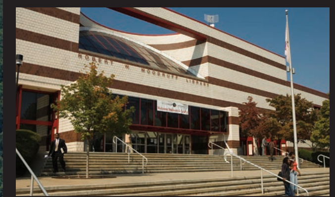
Robert W. Woodruff Library Located near campus on James B. Brawley Drive, the Robert W. Woodruff Library is designed to serve the instructional, informational and research needs for member institutions of the Atlanta University Center Consortium, the world's largest and oldest consortium of Historically Black Colleges and Universities. The institutions that make up the Atlanta University Center Consortium are Clark Atlanta University, Morehouse College, Morehouse School of Medicine and Spelman College.